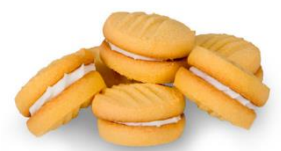
Plate of 4, own recipe - weigh mixture into 15 gm balls before cooking. To be displayed on white plates only. One plate per Exhibitor, 2 entries per Society only.