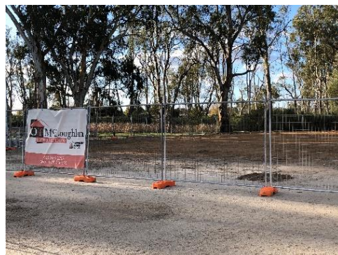
Current View to the Creek