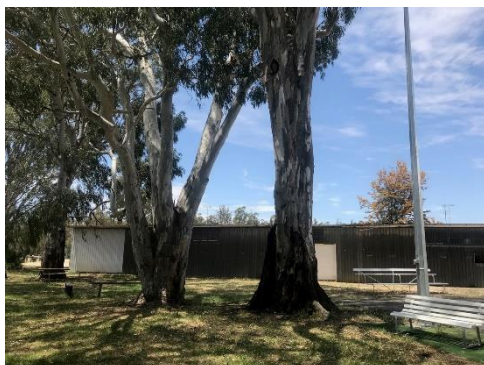
Old View from the Creek

The site has been cleared and building of the new and improved pavilion will commence soon. A Cohuna based architect, AKH Designs, was engaged and designed a V-shaped building to replace the old rectangular shed. Views from the back of the pavilion will allow one to take in the natural environment just outside. This building will be built by a Cohuna based building company. Not only will this new pavilion be a much improved place to display pavilion sections, it will be available to the community for other events throughout the year.