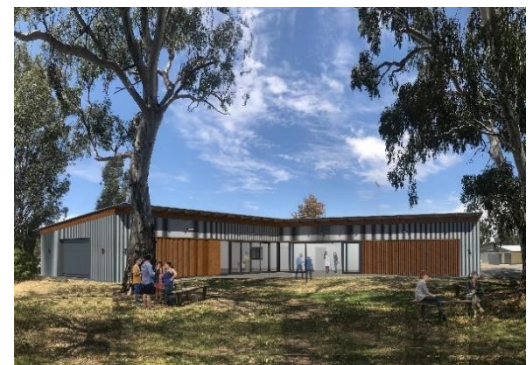
Proposed View from the Creek