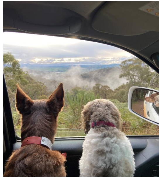
Suzanne Green - Love Where We Live