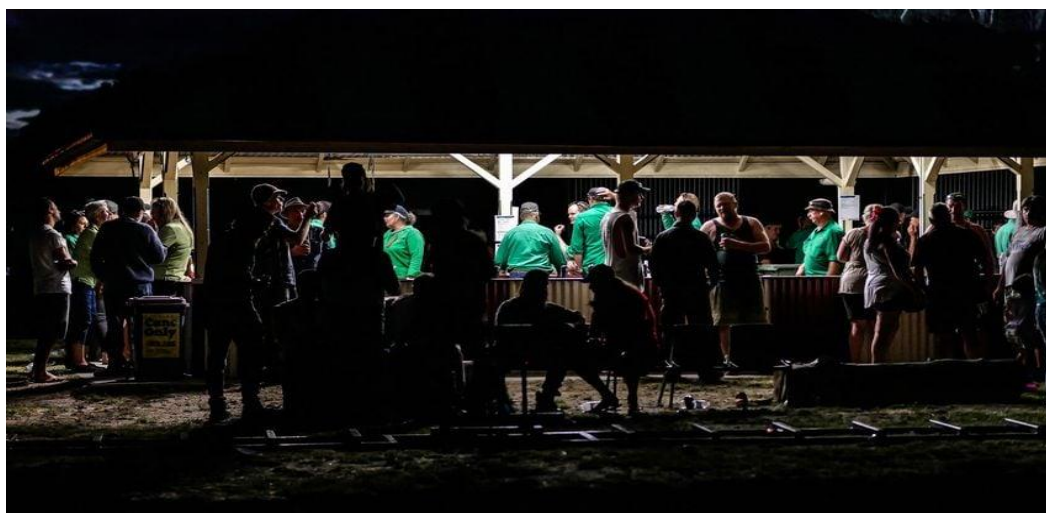
Left: The winning photo from our online photo comp – 159 Years of Memories.