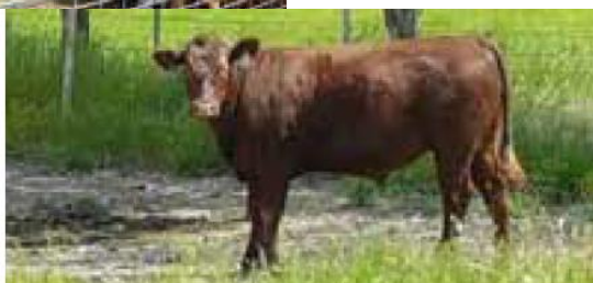
Grand Champion: Gay Ward (Red Poll).