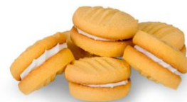
Plate of 4, own recipe - weigh mixture into 15 gm balls before cooking. To be displayed on white plates only. One plate per Exhibitor, 2 entries per Society.